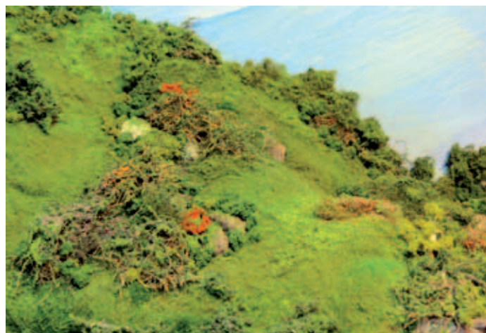
Both above images have had coloured sand sprinkled on foliage to represent flowers